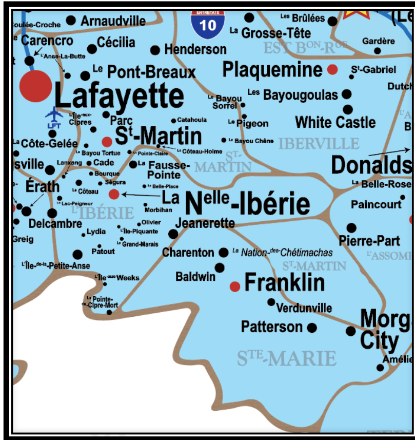
In 1810, Atacapas County included present-day St. Martin, Iberia, and St. Mary Parishes, and the communities above.