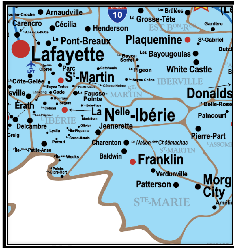
In 1810, Atacapas County included present-day St. Martin, Iberia, and St. Mary Parishes, and the communities above.